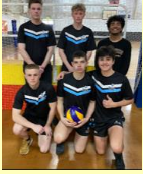
Senior Boys Volleyball Carnival