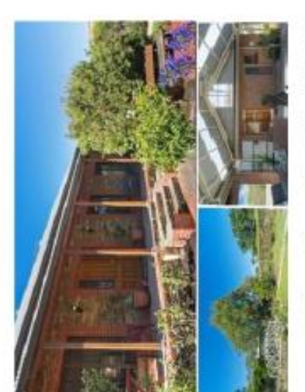
In the heart of Country Birdwood in the Adelaide Hills

lovely secure outdoor space undercover, a large cubby house lots of structured activities to ensure a meaningful & fun stay on a grassed area, a pool table, wi-fi, tailored meal plans and A gorgeous cottage style house, it boasts all the charm of a country home whilst providing modern facilities including a